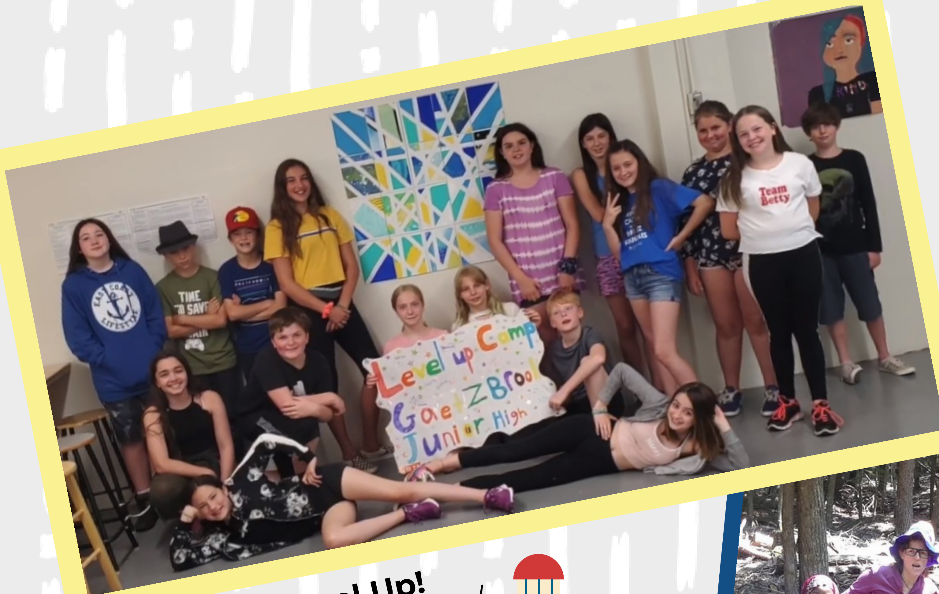
SchoolsPlus Kings East partnered with "Flying Squirrels"

SP HRCE Level Up! https://www.youtube.com/watch?v=0bsndrcv8hM