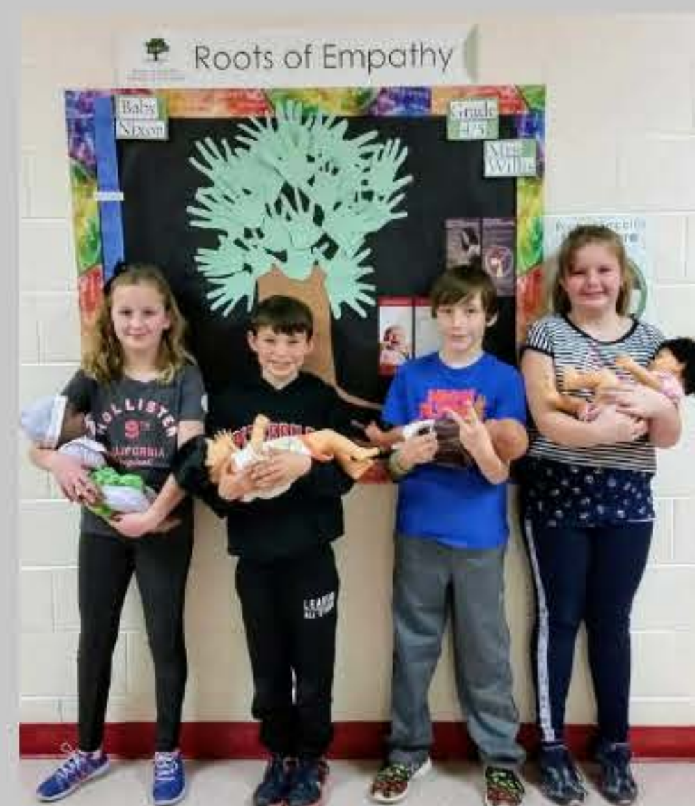
Students participating in ROE with Shelburne SchoolsPlus!