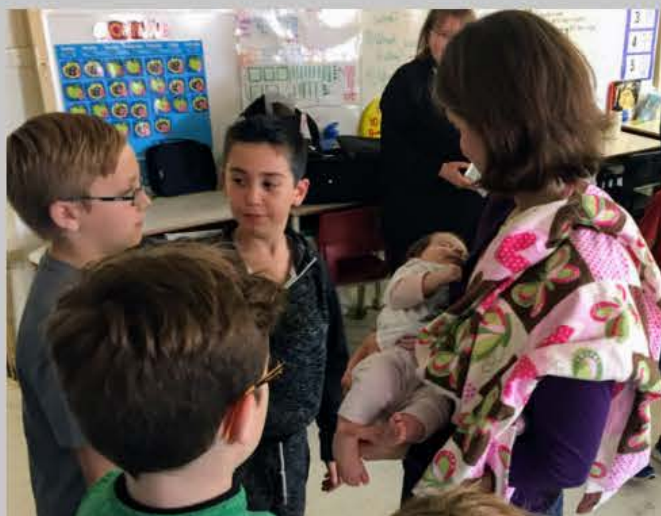
ROE in action in HRSB!