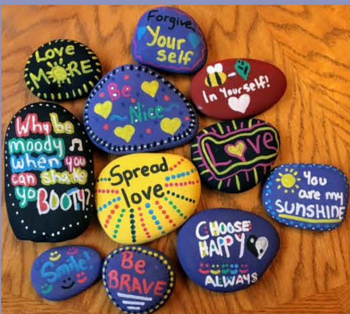
A sample of painted rocks