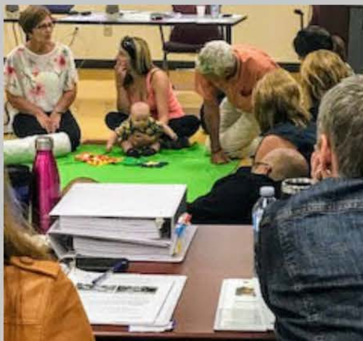
A mom and her baby volunteered at the training. It was definitely a highlight!