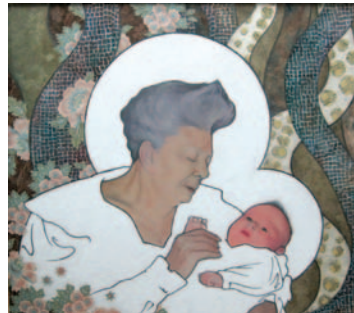
Self-Portrait with Great Grandmother

For additional information on the Artists in Schools program or arts education curriculum, please contact