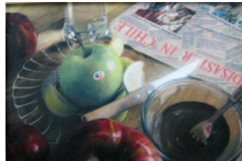
An Apple a Day